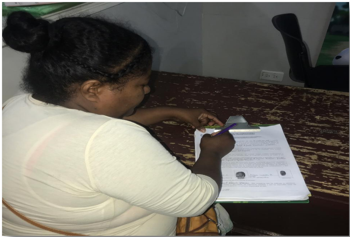
Photo1: informed consent signature