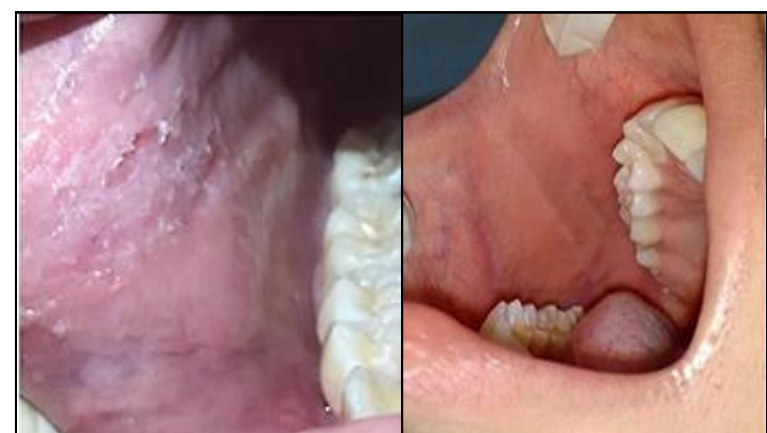
Photos #5: Before and after of a patient using the MPMs with multiple epithelial flaps associated with parafunctional habits (nibbled mucosa).