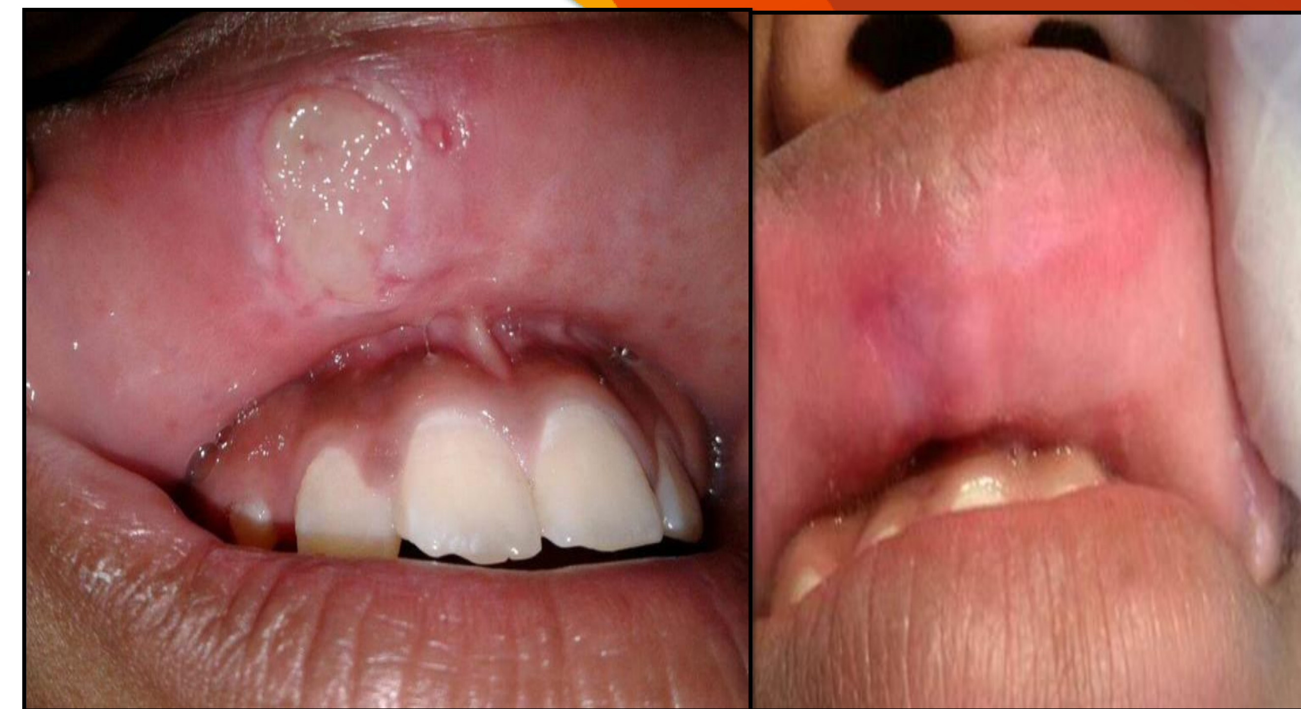
Photo #4: Before and after of a patient using the MPMs that had a mucosal ulcer for parafunctional movements by the Tourette syndrome (After 45 days using the MPMs)