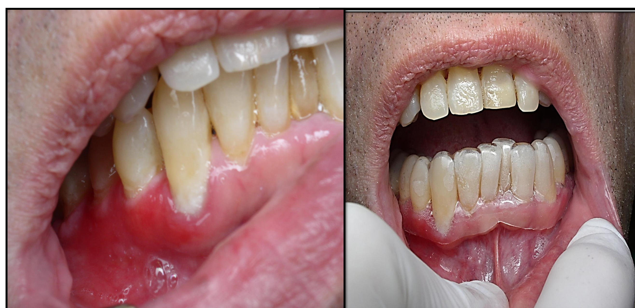
Photo #2: Gingival erythema lesion by atrophic lichen that need a correct medicament application.