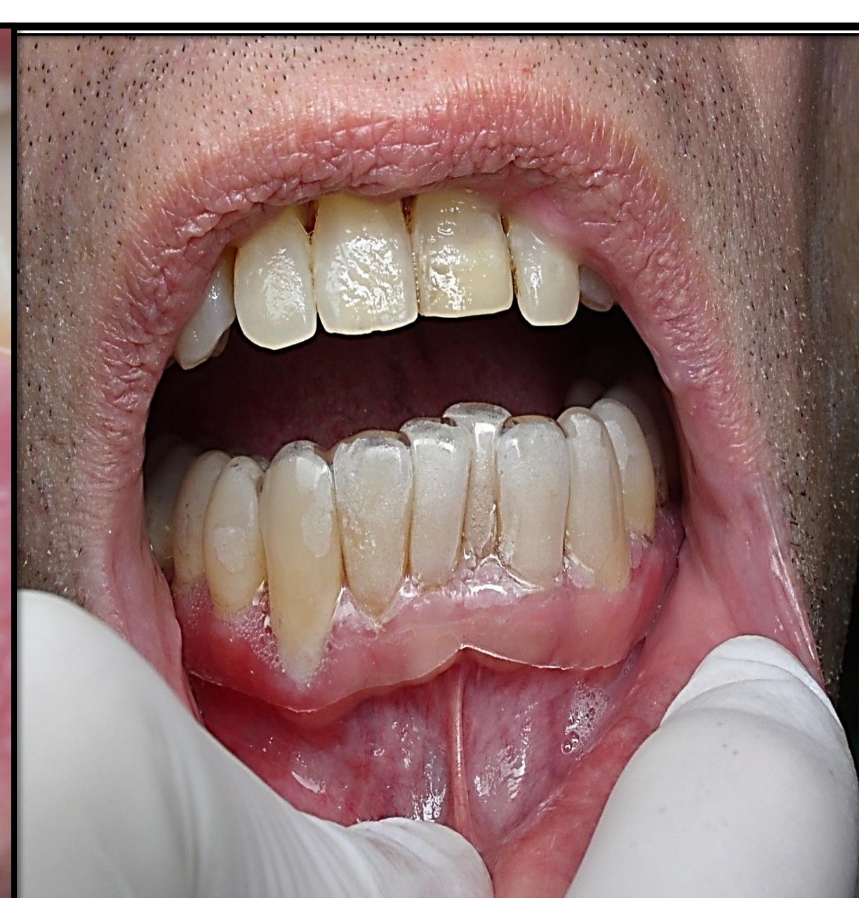
Photo #3: Using the MPMs for the application of a medicine in the gum.